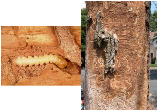
Figure 1. a) Emerald ash borer damages ash trees when the developing flatheaded borer stage tunnels through the area just under the bark. b) Emerald ash borer injuries prevent the plant from moving nutrients, causing progressive decline. Trees ultimately die from the cumulative effects of these injuries.

The tunneling by the insect reduces the ability of the tree to move water and nutrients, producing a progressive weakening of the plant. As the number of these wounds increase over time effects on tree growth become more apparent. Damage usually begins at the top of the tree, and this may result in a thinning of the leaf canopy, as smaller leaves are produced. Twigs and branches may die and in later stages of an infestation the insect may be found in high numbers in the main trunk.