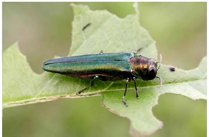
Figure 4. Adult emerald ash borers emerge beginning in late May and feed on leaves for several weeks before the female begins to lay eggs on the bark. Most insecticides used for EAB control can kill adults if applied in time for the insecticide to move into the leaves when adults feed.

Emerald ash borer is controlled by the use of certain systemic-types of insecticides that can be taken into the tree in some manner and will then move to areas where it can kill adults (leaves) or the flatheaded borer larvae (cambium). This is a different approach than is used for many other wood boring insects. Most wood borers, and bark beetles, are controlled using preventive insecticide sprays applied to the bark that kill the insects after egg hatch before they enter the tree ( Fact Sheet 5.530, Shade Tree Borers ). Emerald ash borer is not effectively controlled in this manner, but certain systemic insecticide can be very effective that kill either the adults as they feed on leaves and/or the developing larvae underneath the bark.