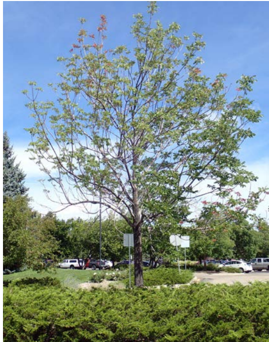
Figure 2. An ash tree showing advanced thinning of the canopy related to injuries produced by the tunneling of the flatheaded borer stage. This tree shows about a 60-70% reduction in crown canopy due to EAB injury. Trees showing this much injury are beyond recovery with insecticides.