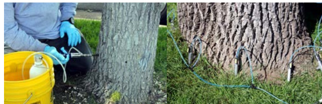
Figures 10a, b. The emerald ash borer insecticides emamectin benzoate and azadirachtin must be injected into the tree. This requires specialized application equipment, such as illustrated, and must be done professionally. These trunk-injected insecticides can provide control for at least two years.

Emamectin benzoate can only be applied through injection of the trunk using specialized equipment. Professional application is required both to apply it effectively and to avoid plant injury.