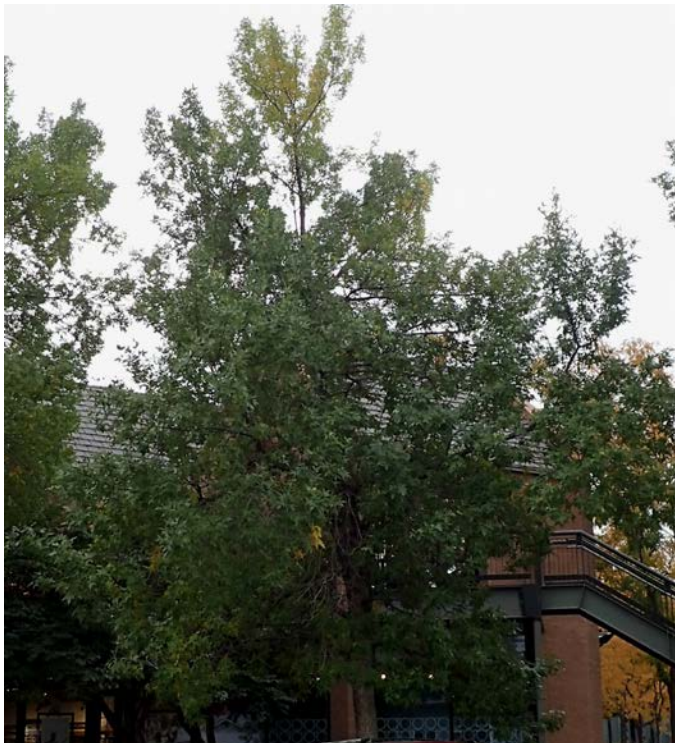
Figure 3. An ash tree showing a slight thinning of the top of the tree related to emerald ash borer injury. In this tree the canopy has thinned 10% or less from emerald ash borer damage. Trees that have thinned up to 30% can usually recover with a program that uses trunk injections of emamectin benzoate.

Once emerald ash borer has begun to infest a tree the injury it causes will increase over time so that the tree will ultimately be killed, unless treated with insecticides. The length of time it will take from the day a tree is first colonized by emerald ash borer until it will die will normally take several years, but the speed of tree decline will depend on many factors. These include the original health of the tree, weather, and the number of emerald ash borers developing in nearby trees.